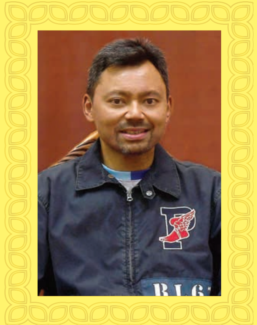
His Royal Highness Prince Haji Al-Muhtadee Billah ibni His Majesty Sultan Haji Hassanah Bolkiah Mu'izzaddin Waddaulah The Crown Prince and Senior Minister at the Prime Minister's Office