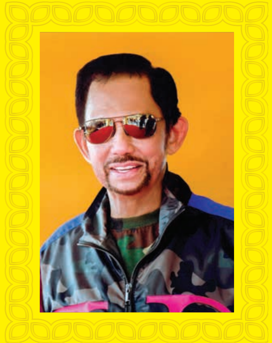
His Majesty Sultan Haji Hassanal Bolkiah Mu'izzaddin Waddaulah ibni Al-Marhum Sultan Haji Omar 'Ali Saifuddien Sa'adul Khairi Waddien The Sultan and Yang Di-Pertuan of Brunei Darussalam